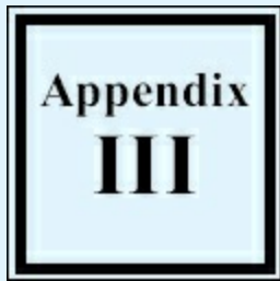
Table of Precedence

The Table of Precedence is related to the rank and order of the officials of the Union and State Governments. The present notification on this subject was issued on 26 July, 1979. This notification superseded all the previous notifications and was also amended many times. The updated version of the Table, containing all the amendments made therein so far (2016), is given below: